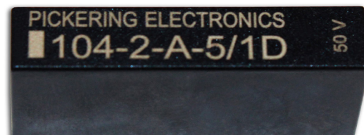
Current Printing Method